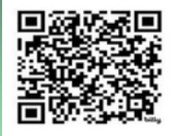
Senior Appointment Calendar