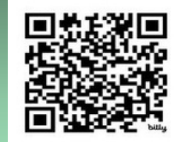
Herff Jones : Cap&Gown